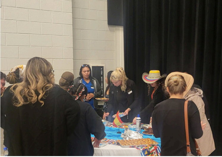
Students gathered around the table sampling cultural foods and drinks

Students also shared foods and beverages that represent their cultural backgrounds, giving participants the opportunity to experience traditions through taste. The table quickly became a place of connection as students sampled dishes, asked questions, and learned about the stories and traditions behind each item. Moments like these reminded everyone that culture is not only something we discuss—it is something we experience, celebrate, and share.