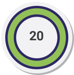
Median Age of Total Enrollment

*Includes Credential Seeking Students *Dual Enrolled- Transfer Pathway Students Excluded *Special Credit-T-Code Students Excluded