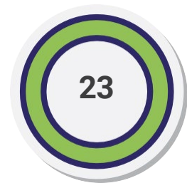
*Median Age of Total Enrollment Excluding Dual Enrolled Students