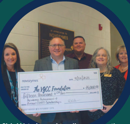
Global biotech powerhouse Novozymes continues their decades-long support at our Franklin Campus.