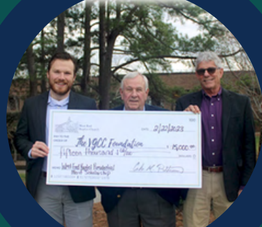
West End Baptist Church of Henderson establishes a new Presidential Merit Award Scholarship

SCHOLARSHIPS AWARDED IN FY 2020-2021: $179,317.25