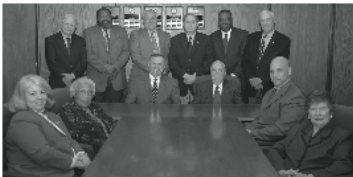
Vance-Granville Community College Board of Trustees